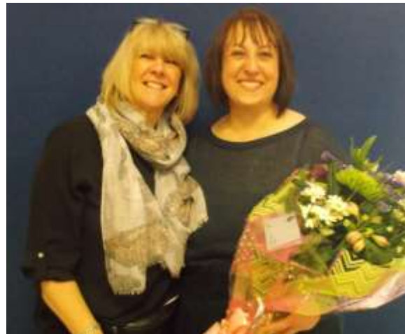
Kelly proudly received her BA (Hons) in Early Childhood Education Studies in 2015

All staff are qualified to level III or above, and all specialise in different areas i.e. ICT, health & safety, special needs, behaviour management etc.