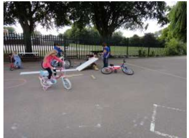
The children brought their own bikes and then they built their own ramps