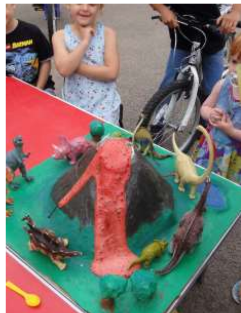
Science can be fun, after spending several days to build and create the volcano, the children watched as it erupted