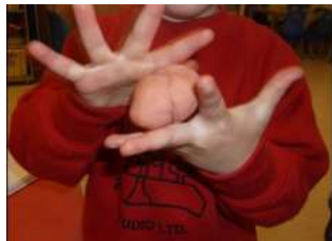
We do 'Dough Disco' with the children, an activity that develops the dexterity and strength in hands and fingers so children can grip pencils and control finer movements ready for writing.