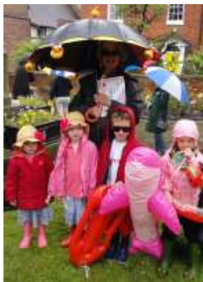
A very wet street market parade 2011, which takes place every year

The Nursery also offers work placements to students studying for a variety of childcare qualifications.