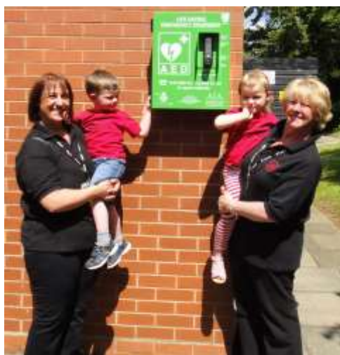
After holding an event in nursery to help raise funds to purchase some defibrillators for the town, we were invited to see the one at Alcester Academy and one by The Unionist Club.