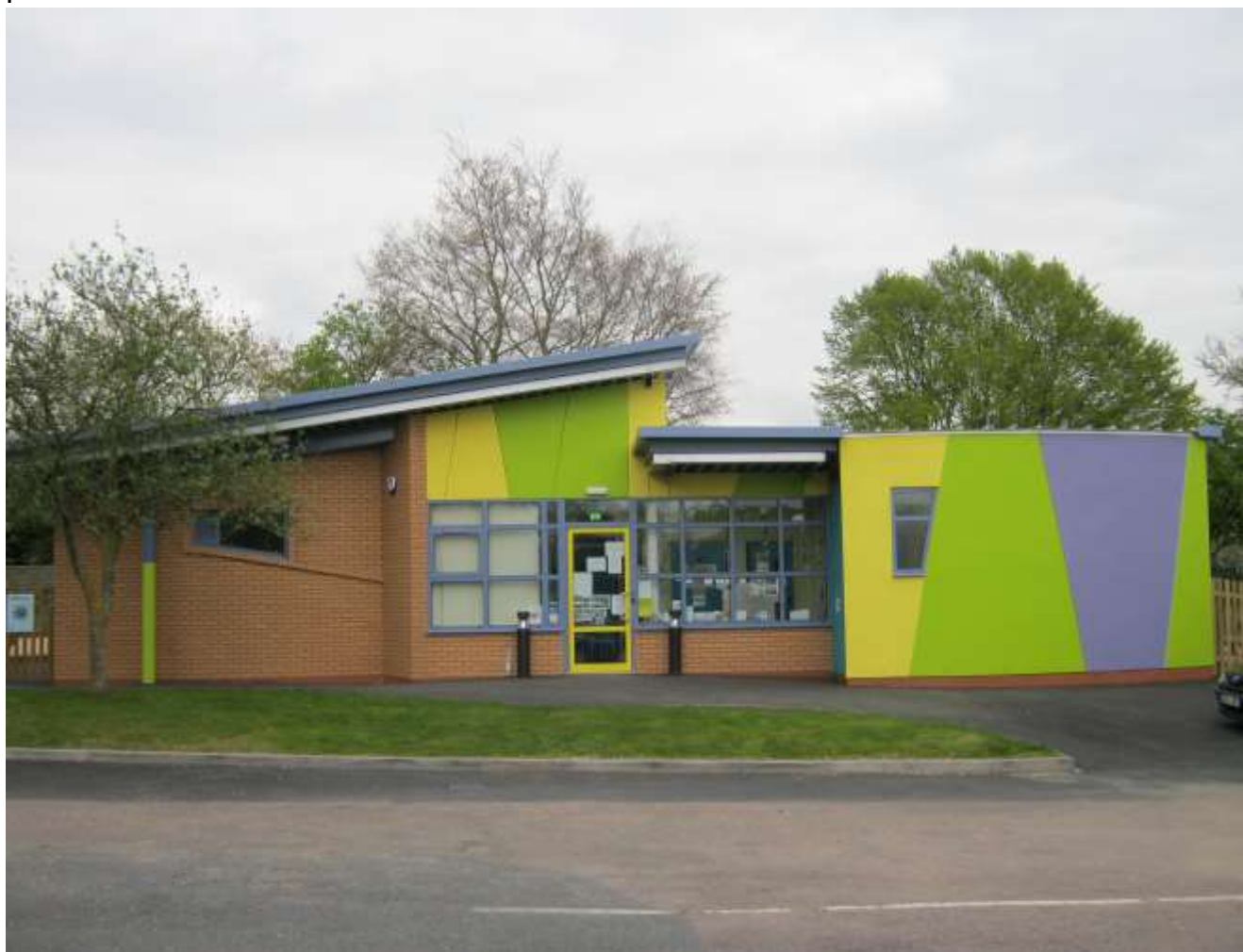
The new building September 2010