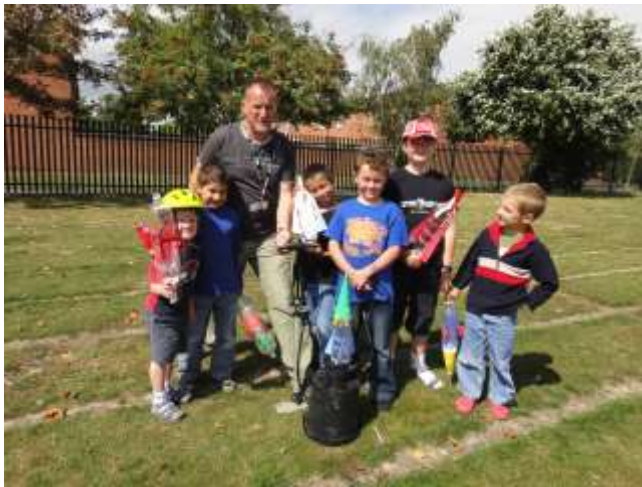
The boys spent the day designing and decorating their water rockets before they were launched