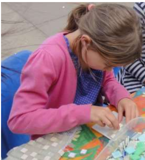
Using tiles to make mosaic's