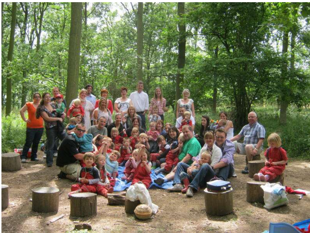
Parents attending & enjoying a hands on forest school session