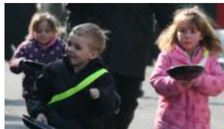
Children running in the annual pancake race which takes place down the High Street